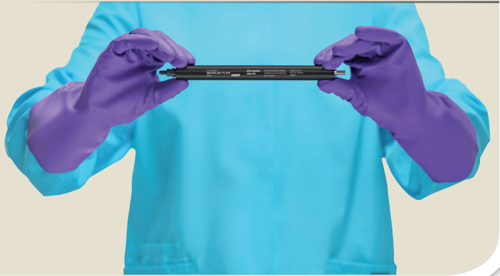
Figure 2. Clean dental waterline tubing. No biofilms or free-floating organisms present.