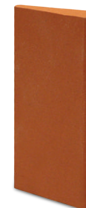
No. 6 I-Stone Wedge Shape | SS6 Medium Grit Follow with fine or super-fine grit stone for finishing. 4-1/2" x 1-7/8" x 3/8" down to 1/8"

Sharpening stones are not shown to size.