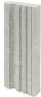
No. 5 Arkansas Bates | SS5 Hard Fine Grit Channeled stone for use with explorers, scalars, carvers and disc-shaped instruments. 4" x 1-1/2" x 1/2"